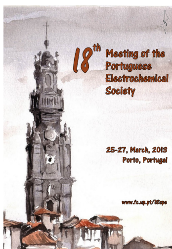
Figure 2. Meeting's poster.